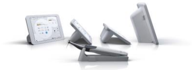
Fig. 1: X-Smart IQ: continuous and reciprocating motion cordless motor controlled by an Apple iOS application.