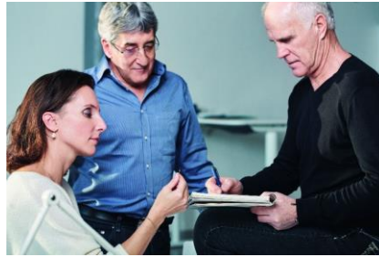
Fig. 6: Passion for innovation through partnership with our endodontic experts: Partner for a better future.