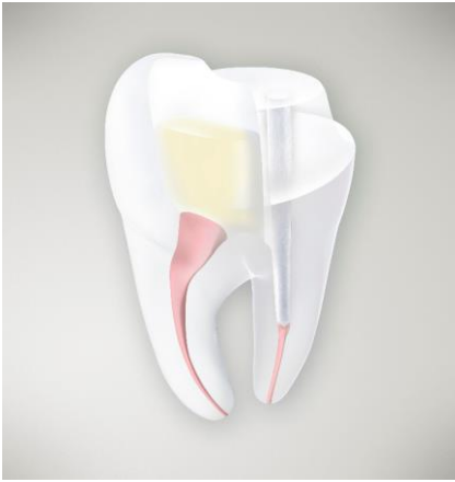
Fig. 5: With the "R2C" Solution, endodontic and restorative products can be found together, for a complete solution.